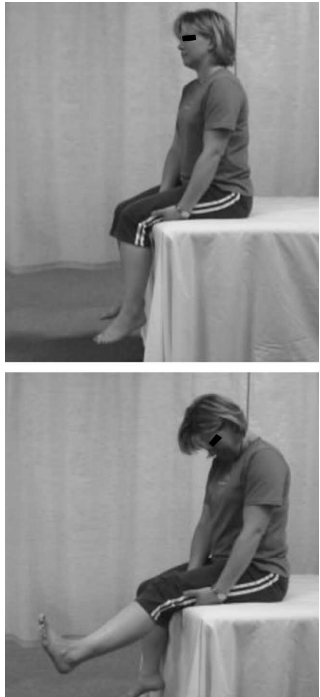
Fig. 5. Active neurodynamic tensile loading technique biased toward the tibial branch of the sciatic tract in a modified slump position.