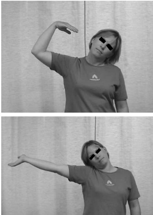
Fig. 4. Active neurodynamic ‘slider’ technique biased toward the median nerve.

Tal-Akabi and Rushton (2000) utilized neural tissue mobilization techniques in their randomized clinical trial on patients with carpal tunnel syndrome, but they did not specify whether ‘sliders’ or tensile loading techniques were